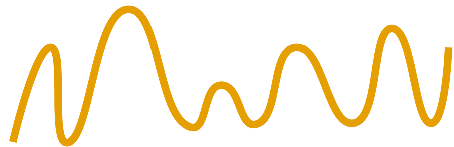
Collective evolution: Partial differential equation