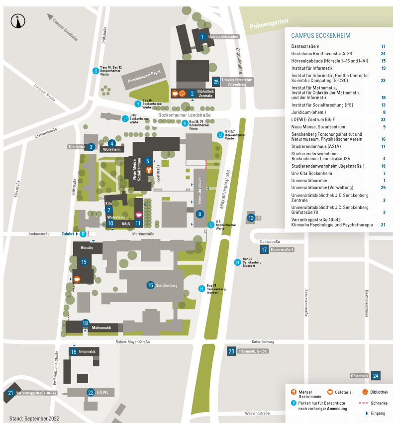
Map of Campus Bockenheim

The conference dinner will take place at Restaurant Feldbergblick , Ginnheimer Stadtweg 57A, 60431 Frankfurt am Main. For directions, see https://maps.app.goo.gl/maTYnggqeGWTvA9v9